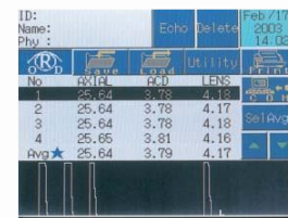
Quick & easy date review.