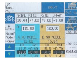
Easy comparison with different parameters.